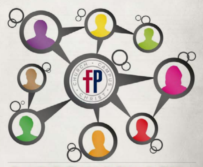
Connecting the Church to the Campus for Christ

Check out www.firstpriority.club/clubfinder