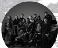
Liberty Worship Collective